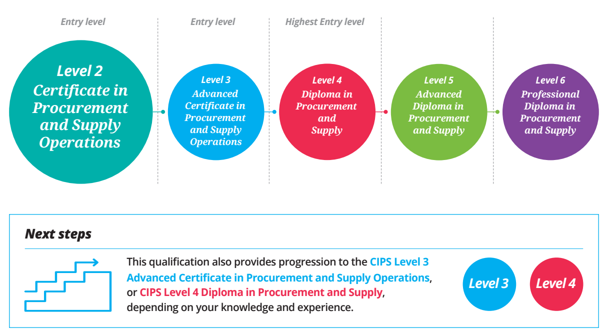
* Refers to levels within the UK RQF. Other regulatory bodies may have different corresponding levels

Developed in close collaboration with experts from the procurement and supply profession and businesses, and with the providers who will be delivering the qualifications, CIPS Level 2 Certificate in Procurement and Supply Operations is designed to develop transferable workplace skills, such as good communication and the ability to work in a team; skills which employers have identified as essential for gaining employment in the sector and for progression in the profession.